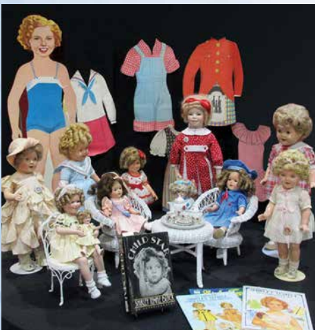
The "Shirley Temple" doll collection was quite varied.