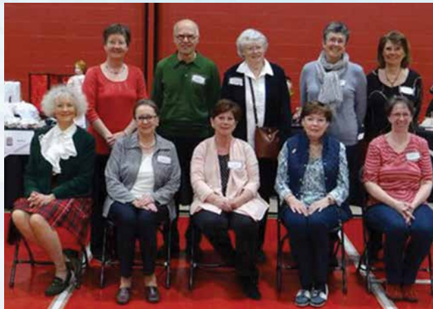
Pictured are the attending club members.