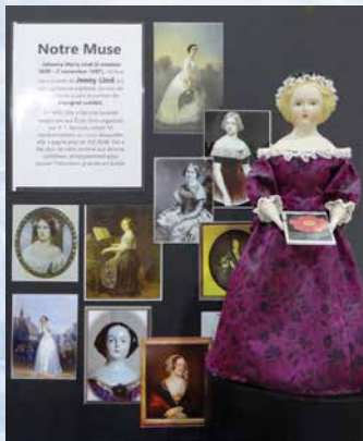
Our Muse – Jenny Lind was on display with a number of pictures of the famous singer.