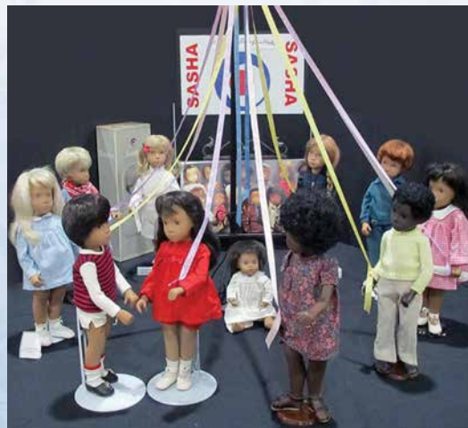
A "Sasha" collection were around a maypole.