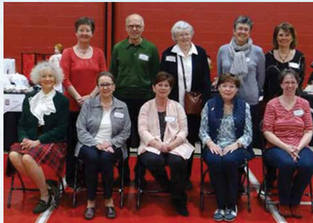
Pictured are the attending club members.