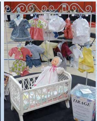
The door prize, "Baby Brenda," by Reliable came with a large wardrobe.